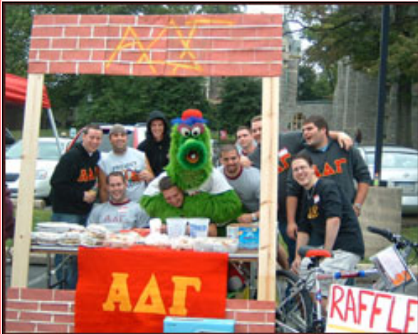
ADG's NEWEST CHAPTER, Alpha Beta, at Philadelphia University.