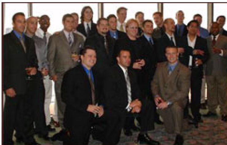
Delegates at last year’s convention, held in Ft. Lauderdale. The event also marked the 10th anniversary of Psi Chapter.

It may seem small, but simply seeing an alumnus means the world to our active brothers. So I urge all young alumni to stay involved, locally and nationally, as you begin your new lives as alumni brothers of ADG.