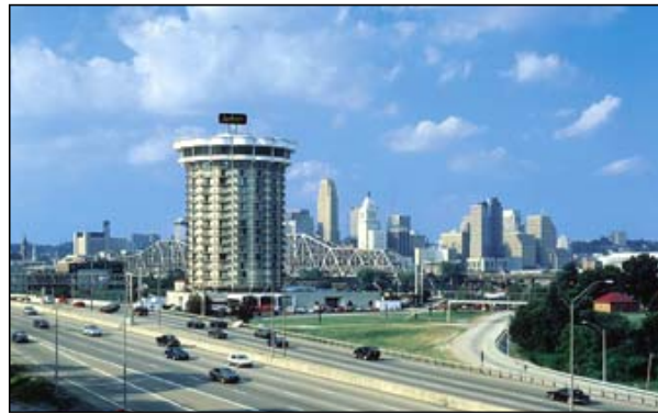
The Radisson Riverfront Hotel

the convention are $150, cover all events and activities including the banquet, and are required to vote and participate in the business meetings. All active delegates are required to pay the full fee, but alumni have the option to pay à la carte based on events you wish to attend.